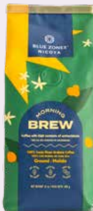
BLUE ZONES 100% GROUND ARABICA COFFEE 340 g COD. 850-33