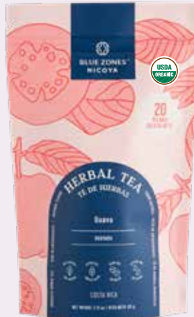
BLUE ZONES ORGANIC HERBAL TEA GUAVA 60 g COD. 100-33