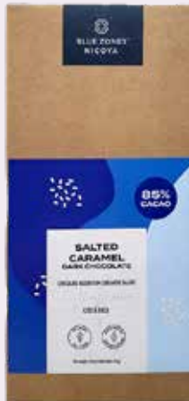
BLUE ZONE DARK CHOCOLATE WITH SALTED CARAMEL 85% COCOA BAR 80 g 920-05