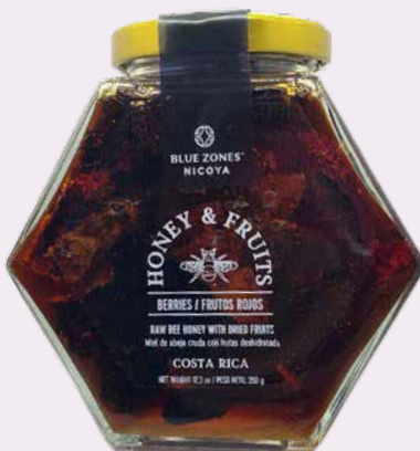
BLUE ZONES HONEY & FRUITS RAW BEE HONEY WITH DRIED BERRIES 350 g 600-22