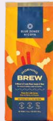
BLUE ZONES MAYA NUT WITH SPICES 500 g COD. 850-32