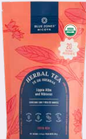
BLUE ZONES ORGANIC HERBAL TEA LIPPIA, ALBA AND HIBISCUS 60 g COD. 100-30