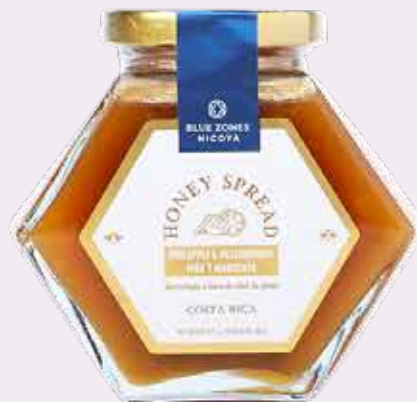
PINEAPPLE AND PASSION FRUIT WITH BEE HONEY BLUE ZONES 190 g COD. 650-15