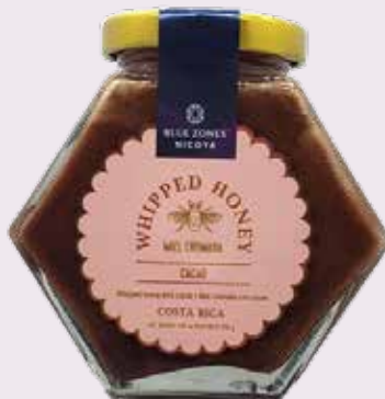
WHIPPED HONEY CACAO BLUE ZONES 200 g 600-25