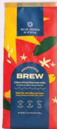
BLUE ZONES MAYA NUT, COFFEE & CACAO 340 g COD. 700-09