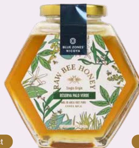
BLUE ZONES RAW BEE HONEY 100% PURE SINGLE ORIGIN RESERVA PALO VERDE 500 g 600-11