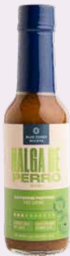
BLUE ZONES MILD HOT SAUCE NALGA DE PERRO 155g COD. 200-01