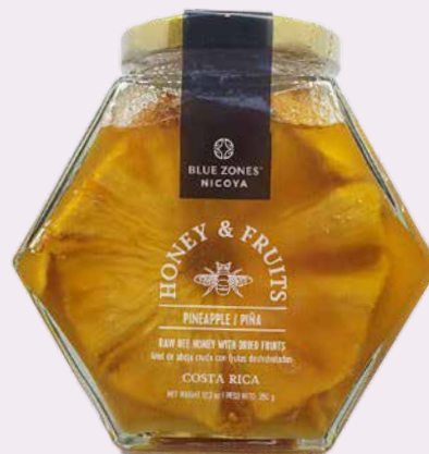
BLUE ZONES HONEY & FRUITS RAW BEE HONEY WITH DRIED PINEAPPLE 350 g 600-20

Our Honey & Fruits are perfect to accompany any breakfast recipe, with tea, with a cheese board or alone as the ideal and healthy dessert.