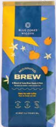
BLUE ZONES MAYA NUT WITH COFFEE 340 g COD. 850-03