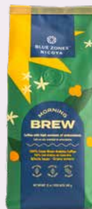
BLUE ZONES 100% WHOLE BEAN ARABICA COFFEE 340 g COD. 850-34