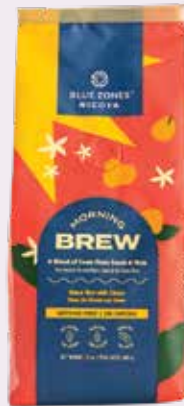
BLUE ZONES MAYA NUT WITH CACAO 500 g COD. 850-31