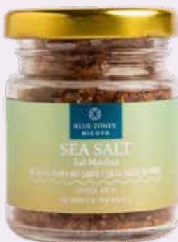
BLUE ZONES SEA SALT NALGA DE PERRO 87 g COD. 151-01