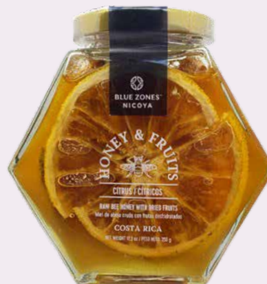
BLUE ZONES HONEY & FRUITS RAW BEE HONEY WITH DRIED FRUITS 350 g 600-21