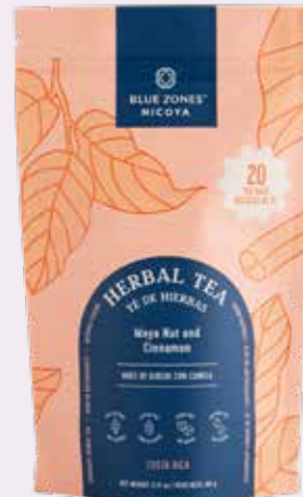
BLUE ZONES HERBAL TEA MAYA NUT AND CINNAMON 60 g COD. 100-28