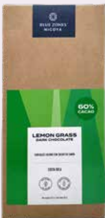
BLUE ZONE DARK CHOCOLATE WITH LEMONGRASS 60% COCOA BAR 80 g 920-01

At Blue Zones Nicoya we have created 6 different flavors of dark chocolate that combine all the benefits of the Costa Rican tropical cocoa with delicious pairings of fruits, herbs and honey, that make us explore the different ranges of chocolate with the flavors of the Blue Zone of Costa Rica.