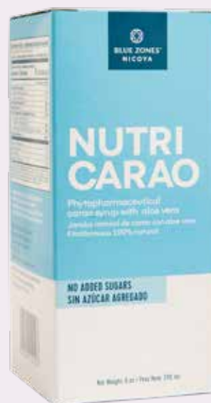
BLUE ZONES SUGAR FREE NUTRI-CARAO NATURAL SYRUP WITH ALOE VERA 240 mL COD. 500-02