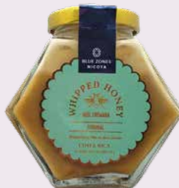
WHIPPED HONEY ORIGINAL BLUE ZONES 200 g 600-23