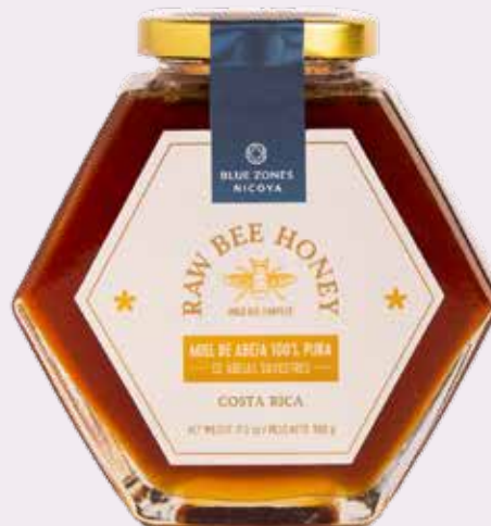
BLUE ZONES RAW BEE HONEY 100% PURE 500 g 600-07