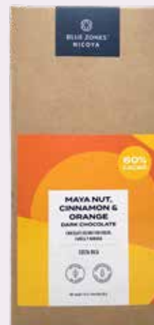
BLUE ZONE DARK CHOCOLATE WITH MAYA NUT CINAMMON- ORANGE 60% COCOA BAR 80 g 920-06