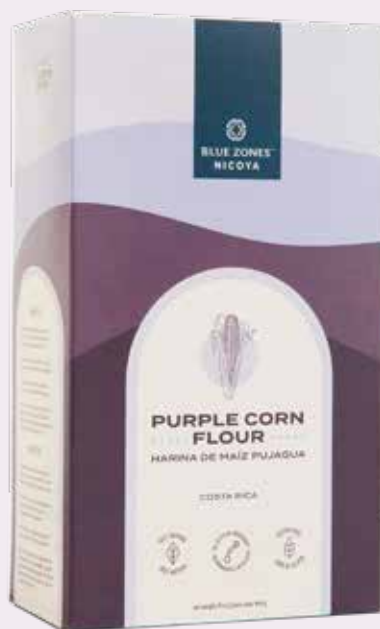
BLUE ZONES PUJAGUA PURPLE CORN FLOUR. 454 g COD. 300-01