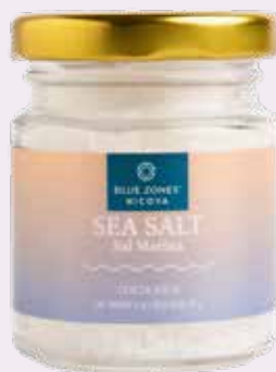
BLUE ZONES SEA SALT 100% PURE 87 g COD. 151-05

Unprocessed sea salt, naturally conserving magnesium (helps the normal function of muscles and nerves) and iodine (helps the normal function of thyroids) Better and richer taste than regular table salt. Does not contain artificial ingredients. Delicious combinations that will enhance the taste of your dishes.