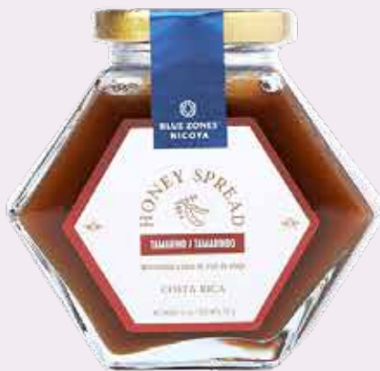
TAMARIND WITH BEE HONEY BLUE ZONES 190 g COD. 650-16