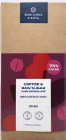
BLUE ZONE DARK CHOCOLATE WITH COFFEE AND RAW SUGAR 75% COCOA BAR 80 g 920-04