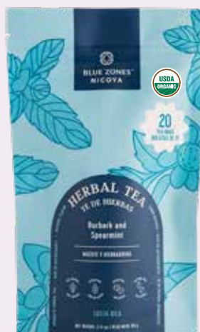
BLUE ZONES ORGANIC HERBAL TEA BURBARK AND SPEARMINT 60 g COD. 100-32