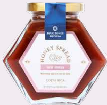
GUAVA WITH BEE HONEY BLUE ZONES 190 g COD. 650-14