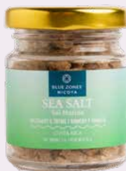
BLUE ZONES SEA SALT ROSEMARY & THYME 87 g COD. 151-02