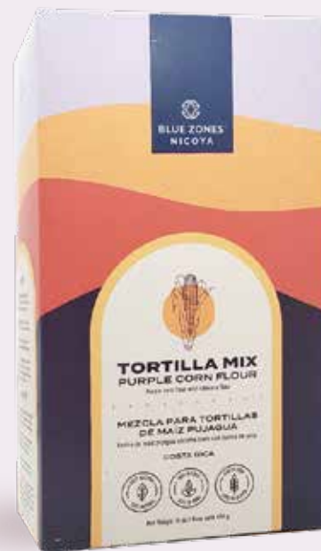
BLUE ZONES PUJAGUA PURPLE CORN FLOUR. TORTILLA MIX 454 g COD. 300-02