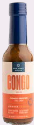
BLUE ZONES MEDIUM HOT SAUCE CONGO 155g COD. 200-02