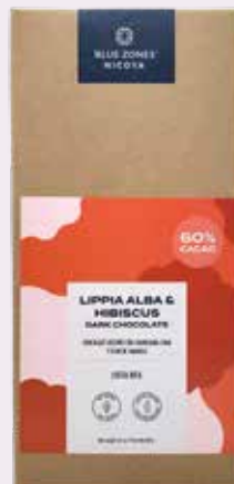
BLUE ZONE DARK CHOCOLATE WITH LIPPIA ALBA & HIBISCUS 60% COCOA BAR 80 g 920-02