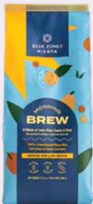
BLUE ZONES 100% GRANULATED MAYA NUT 500 g COD. 850-30