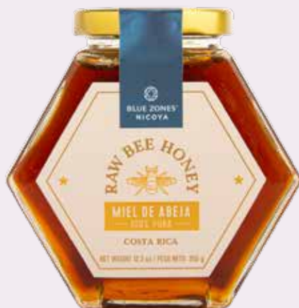
BLUES ZONES RAW BEE HONEY 100% PURE 350 g 600-02