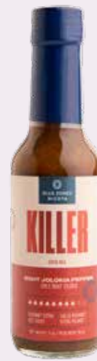
BLUE ZONES EXTRA SPICY HOT SAUCE KILLER 155g COD. 200-03