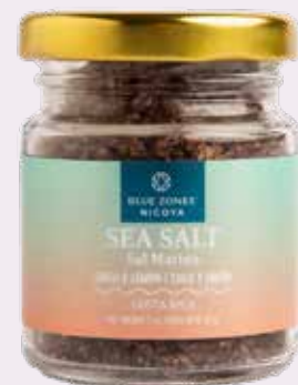
BLUE ZONES SEA SALT CHILLI & LEMON 87 g COD. 151-03