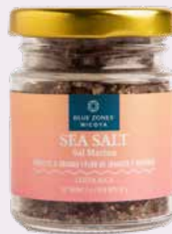
BLUE ZONES SEA SALT JAMAICA & ORANGE 87 g COD. 151-04