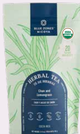
BLUE ZONES ORGANIC HERBAL TEA CHAN AND LEMONGRASS 60 g COD. 100-31