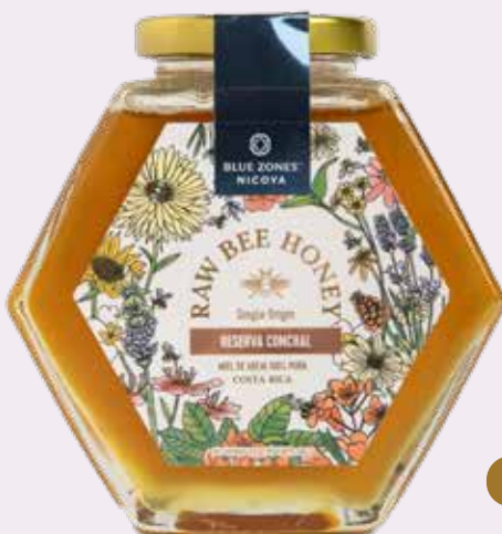
BLUE ZONES RAW BEE HONEY 100% PURA SINGLE ORIGIN RESERVA CONCHAL 500 g 600-12