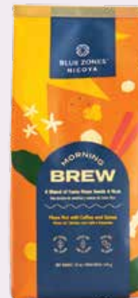
BLUE ZONES MAYA NUT, COFFEE & SPICES 340 g COD. 700-08