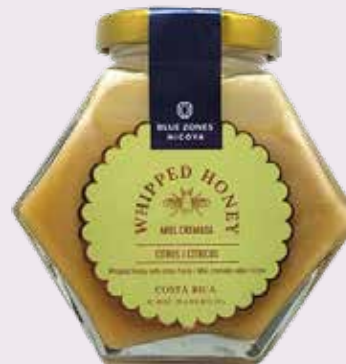
WHIPPED HONEY CITRUS BLUE ZONES 200 g 600-24