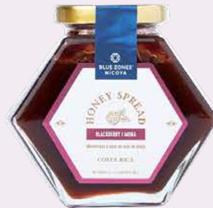
BLACKBERRY WITH BEE HONEY BLUE ZONES 190 g COD. 650-17