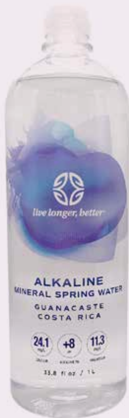
BLUE ZONES ALKALINE MINERAL WATER 1 L COD. 901-04